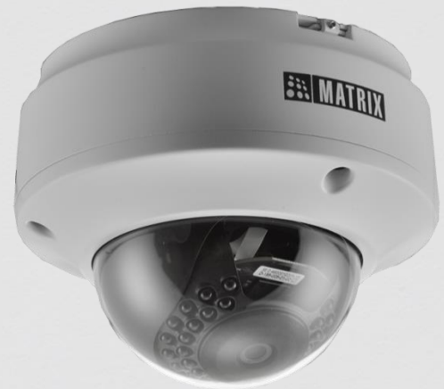
SATATYA CIDR20FL60CW-S 2MP IR Dome Camera with 6mm Lens

Matrix project series IP Cameras are built using superior components such as Sony STARVIS sensor and higher MTF lens to offer unmatched image quality especially during the low light conditions. Powered by True WDR algorithm, these cameras offer consistent image quality even in highly varying lighting conditions. Built in intelligent analytics including Intrusion Detection, Trip Wire, etc. ensure real-time security. Moreover, H.265 compression and Automatic Motion based Frame Rate Reduction save bandwidth and storage up to 50%.